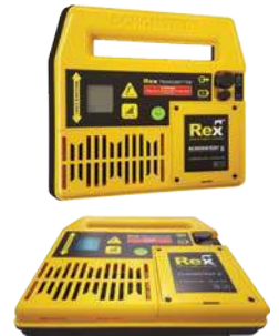
Slim, Sleek & Powerful Transmitter 3.5 lbs and 1.75" thick