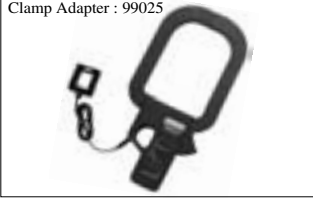
Clamp Adapter : 99025