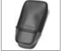
Carrying case : 93032