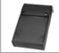
Carrying case : 93030