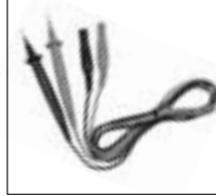
Test lead : 98011