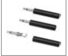
Output Plug : 98012