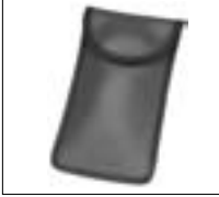
Carrying case : 93033