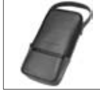
Carrying case : 93031