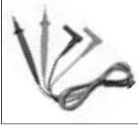
Test lead : 98010