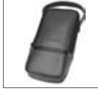
Carrying case : 93034