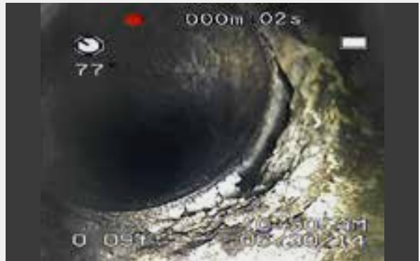
Crystal Clear Screen (Wohler VIS 350)