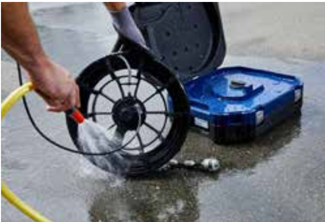
Fast cleaning for lasting hygiene: Simply splash the robust case and the viper with water