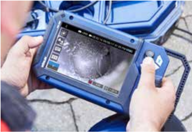
Razor sharp pictures in HD-quality, clear menu and comfortable to hold