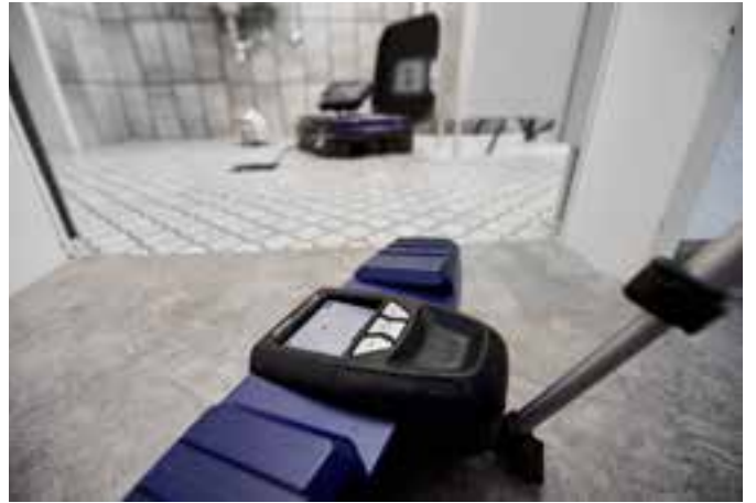
Precise location of the camera head with the Wöhler L 200 Locator