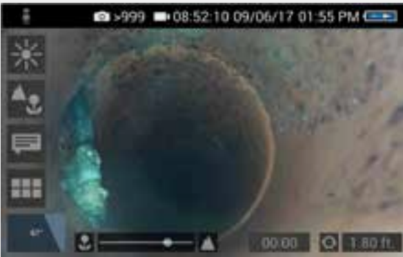
High Definition Display (Wohler VIS 700): razor sharp images