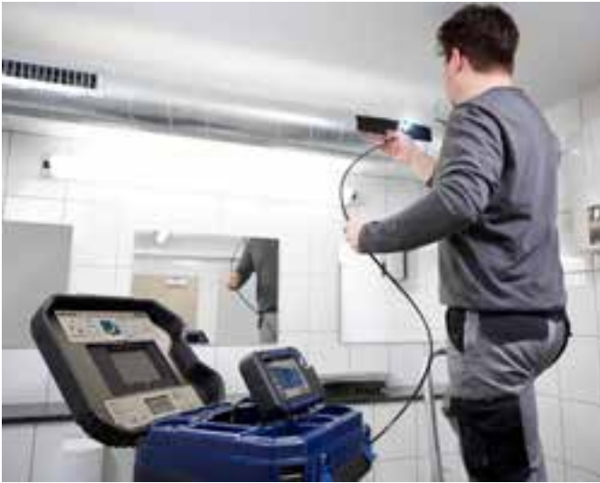
Easy inspection of ventilation systems with the 100 foot camera rod