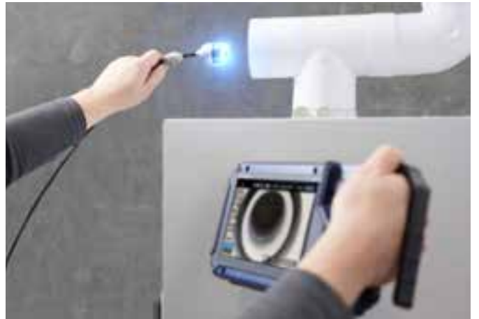
Inspection of flue gas lines from 2": easily negotiates tight bends of 87°