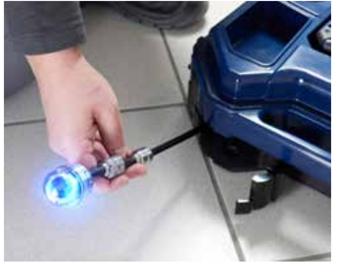
The 100 foot camera rod is at the same time flexible and durable because of its construction