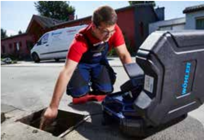
Secure drain inspection with the waterproof camera head