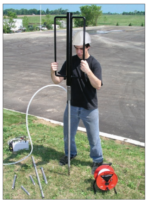
Installing Piezometers with a Manual Slide Hammer