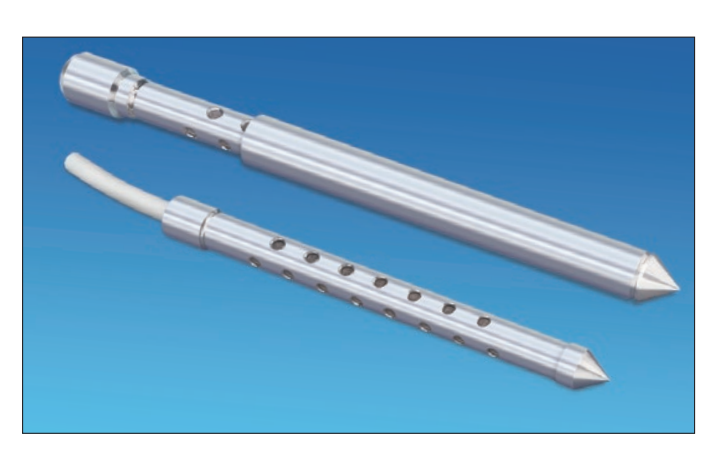
Model 615 Drive-Point and Shielded Drive-Point Piezometer

Solinst Drive-Point Piezometers can be driven into the ground with any direct push or drilling technology, including the Manual Slide Hammer shown at right. To avoid clogging or smearing of the screen during installation, a shielded version is also available.