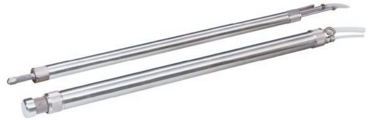
Solinst Bladder Pumps available in Stainless Steel 1" and 1.66" (25 mm and 42 mm).