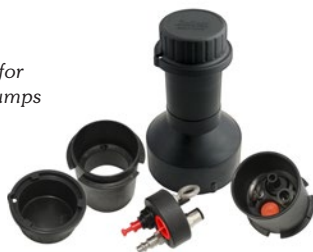
Well Caps for Dedicated Pumps

The caps slip easily onto 2" dia. (50 mm) wells. Adaptors to fit 4" dia. (100 mm) wells are also available. They have quick-connect fittings for the drive and sample tubing.