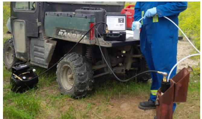
Sampling with a Dedicated Bladder Pump using Portable, Rugged, Easy-to-use, Compressor and Controller

For water level monitoring there is an access hole to fit a Solinst Model 101 Water Level Meter or Levellogger. An eyebolt is provided for a pump support cable or for suspension of a Solinst Levellogger, (see Model 3001 Data Sheet) or other device.