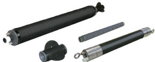
Model 800 Packers 3.9" and 1.8" (99 mm and 46 mm)

Model 800 Low-Pressure Packers can be used with Solinst Bladder Pumps to minimize purge times by reducing purge volumes. This reduces the cost of water disposal and labour. Packers are available in single point or straddle packer designs, and in sizes to fit 2" (50 mm) to 5" (127 mm) dia. wells. (See Model 800 Data Sheet.)