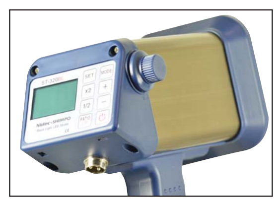
Operation Panel & Flash Adjustment Dial