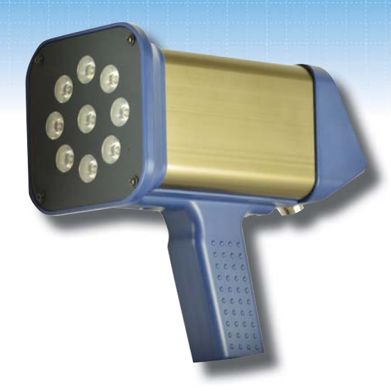
ST-320BL Black Light LED Stroboscope

The ST-320BL is designed for speed and frequency measurements in the printing, packaging, textile, automotive, cable, mining, steel, chemical, optical and medical industries in various applications.