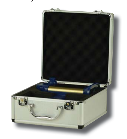
ST-320BL in Included Metal Carrying Case