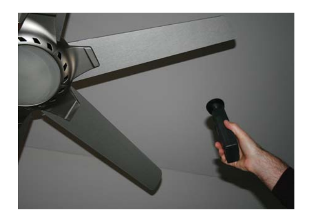
ST-1000 Checking Fan Speed and Balance