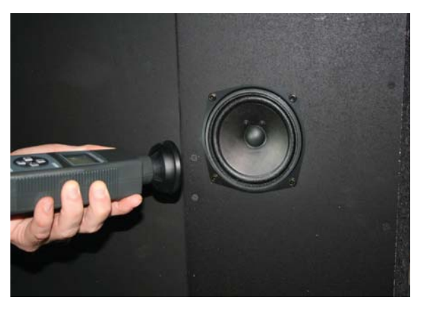
ST-1000 Acoustical Speaker Analysis