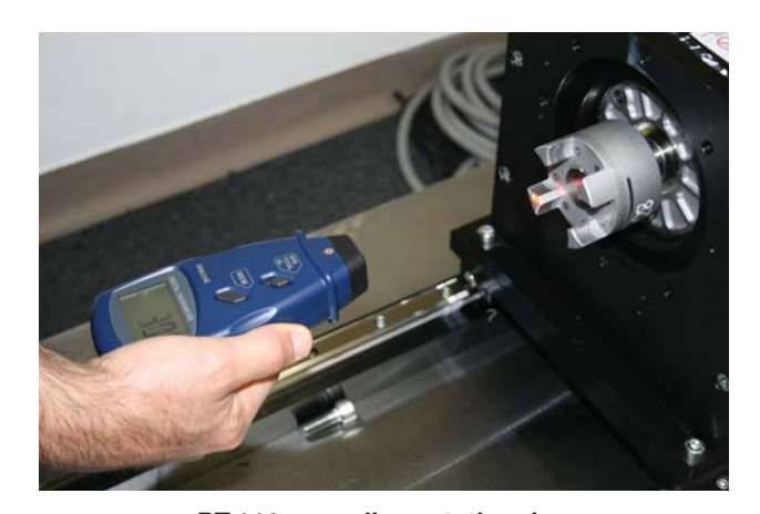
PT-110 recording rotational speed of machinery.