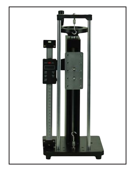
Stand with Optional Tensile Frame and Digital Scale