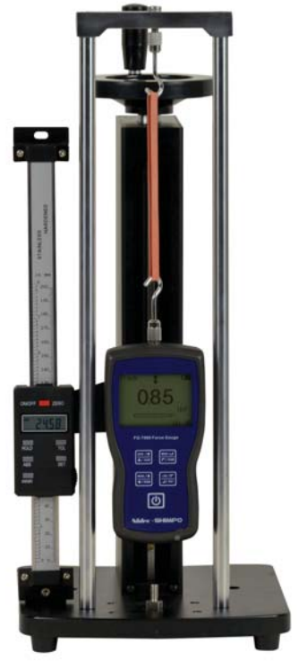
FGS-250W with FG-7000 Force Gauge Shown Performing Tensile Test