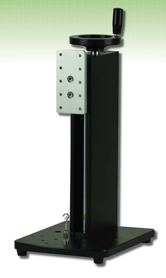
FGS-250W Manual Hand Wheel Operated Test Stand

Optional accessories include a Digital Scale which accurately tracks distance movement and a Tensile Frame adapter kit which enables extended clearance for tensile tests. Shimpo offers a variety of grips and fixtures to create the required set-up for your test parameters. The FGS-250W's maximum 250 lbf (125 kgf) capacity combined with the precision wheel movement operation yields an ideal manual test stand for a full range of lab or production line testing applications.