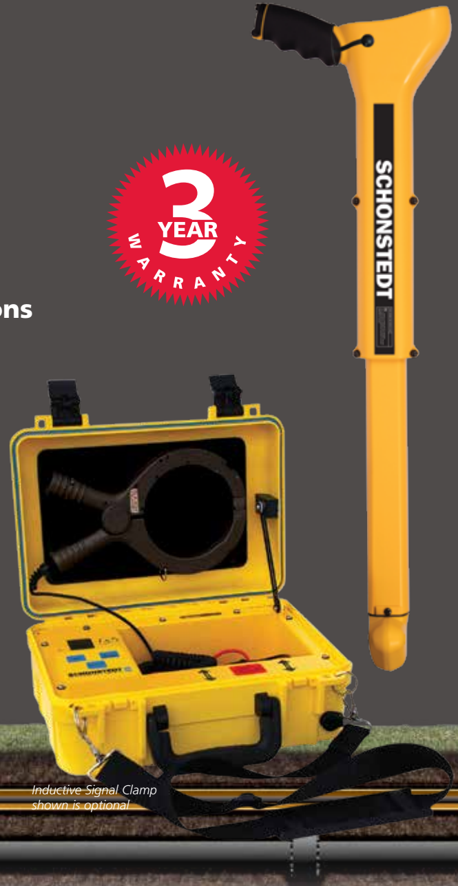
Inductive Signal Clamp shown is optional