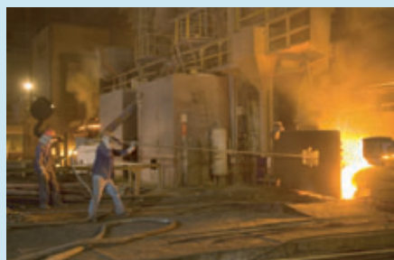
Checking worker exposure to airborne contaminants