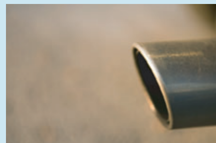
Engine Exhaust Testing