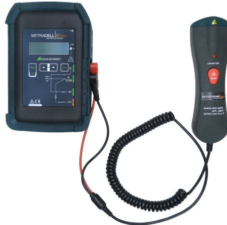
Figure 3: Battery tester with temperature sensor METRATHERM IR BASE (Z680A)