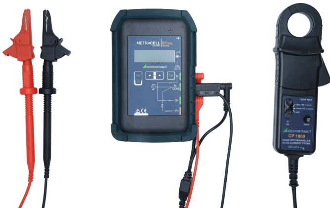
Figure 2: Battery tester with AC/DC current clamp sensor CP1800 (Z204A)