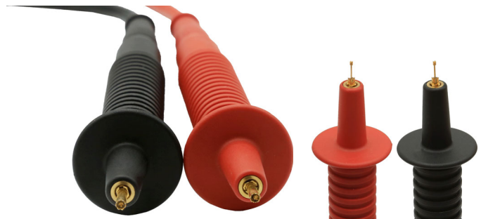
Figure 4: Kelvin probes with spring-loaded contact pins