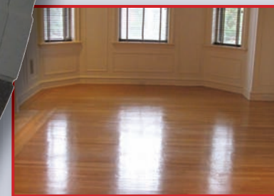
Detect potential moisture problems without making pinholes