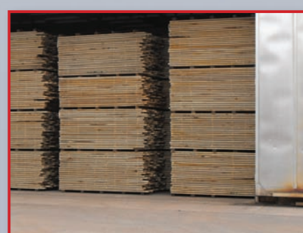
A kiln will dry these hardwood boards to a moisture content of <10%