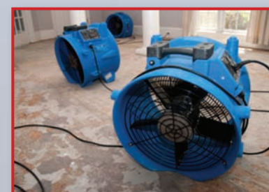
Check ambient temperature and humidity during restoration drying