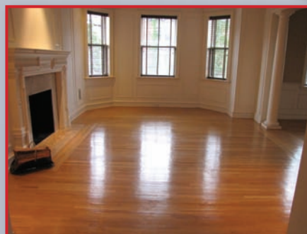
Detect potential moisture problems without making pinholes