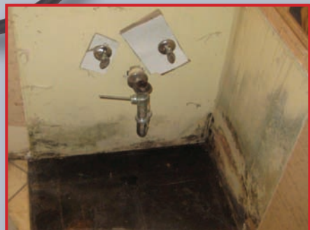
Locate moisture/water damage