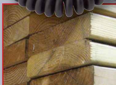
Check wood for dampness or rot