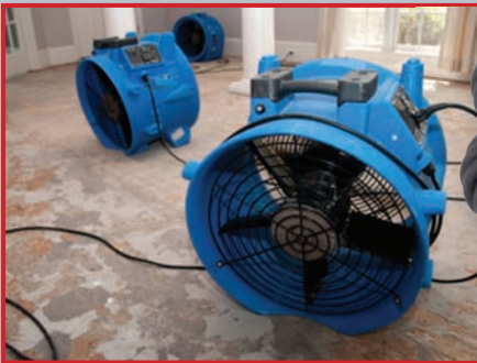
Check ambient temperature and humidity during restoration drying