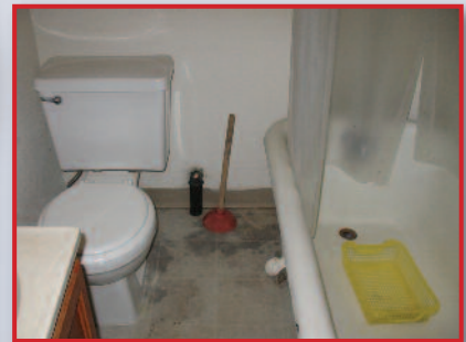
Locates moisture under bathroom floors