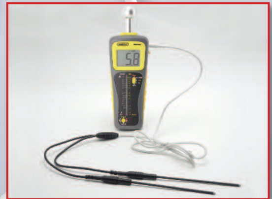
The MMD950 with the optional MP905 Deep Wall Moisture Probe