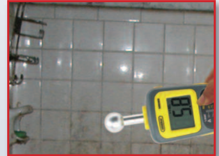
Locate moisture/water damage deep behind tiles