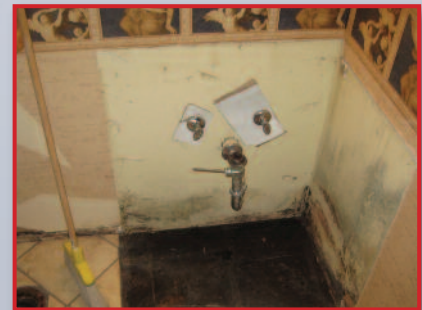
Locates moisture under bathroom vanities where mold thrives