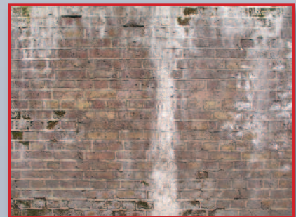
Check for moisture in masonry