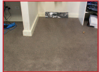
Check for moisture damage deep below carpet surface