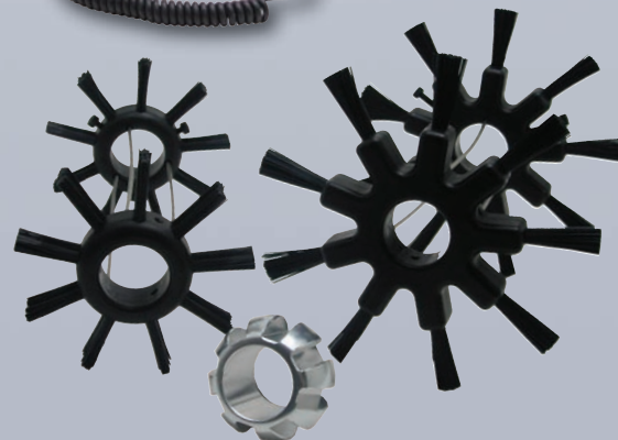
2, 4 and 6 in. probe centering accessories