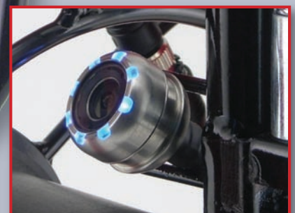
640 x 480 pixel (VGA) resolution camera-tipped probe has eight super-bright white LEDs