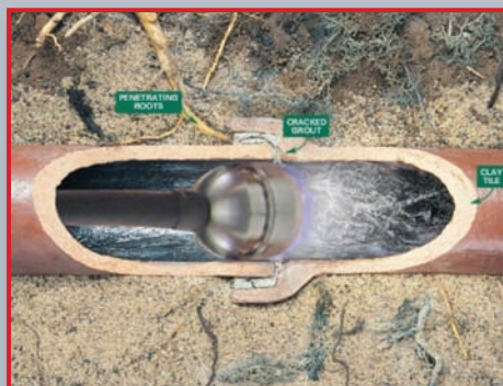
Tree roots cracking and invading a clay sewer pipe