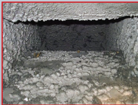
A probe's-eye view of a filthy air-conditioning duct