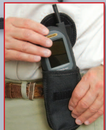
Handy pouch with belt clip