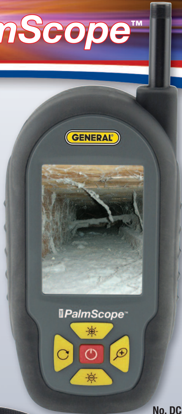
No. DCS950 (actual size)

Nylon Pouch with Belt Clip, Four Probe Tip Accessories (pickup hook, magnetic pickup, 90° mirror, thread protector), User's Manual, 1 Year Limited Warranty