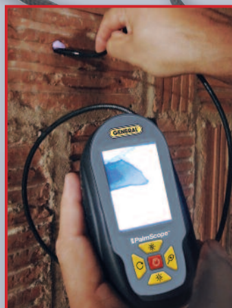
Look behind a wall through any small hole