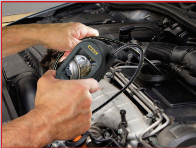
Perfect for crowded modern engine compartments