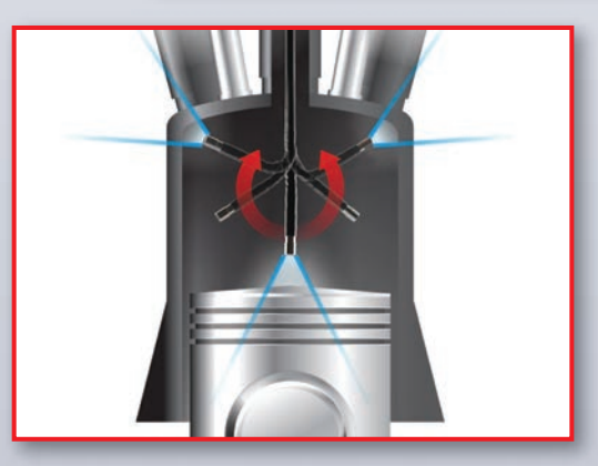
The 270° sweep of the articulating probe makes it possible to view areas "behind" the probe tip