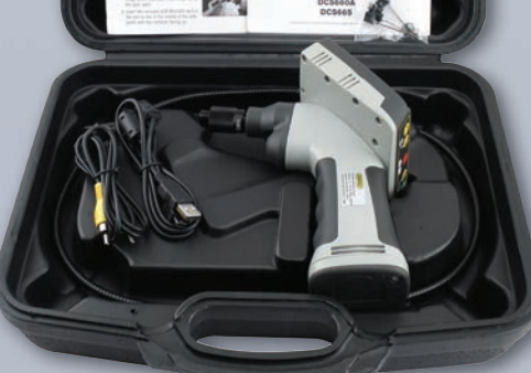
A packaged DCS660A system