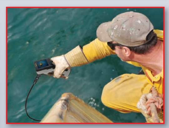
Makes underwater inspections possible