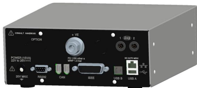
PACE1001 from the rear