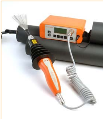
Elcometer 266 DC Holiday Detector

The Elcometer 266 DC Holiday Detector provides accurate detection of pinholes, flaws, inclusions, thin spots and bubbles in a coating.